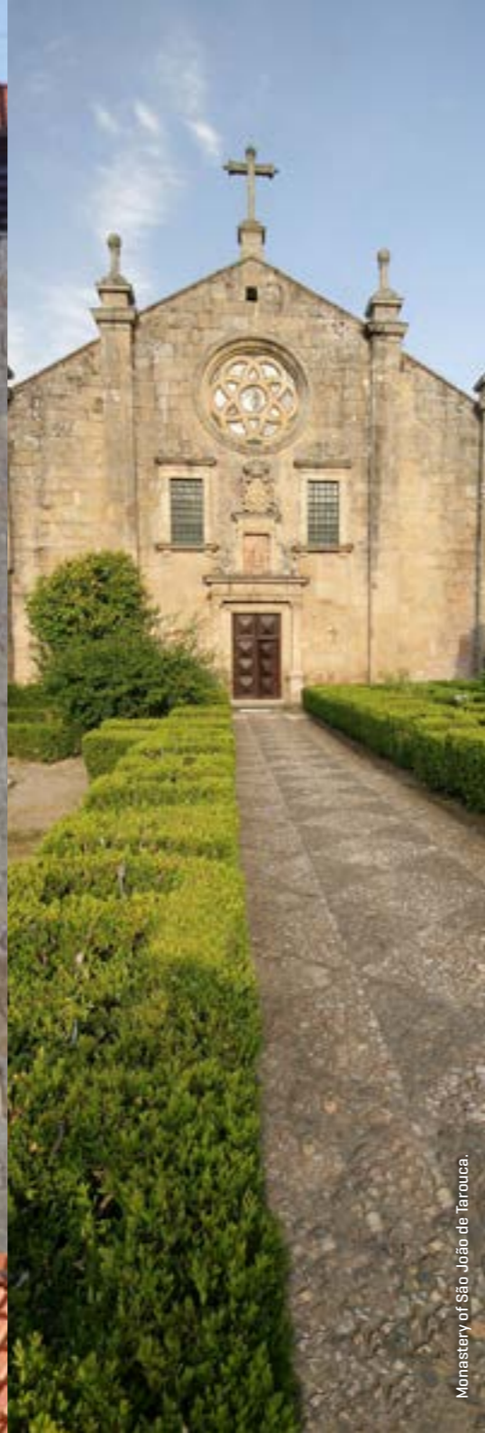
Monastery of São João de Tarouca.